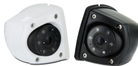
EXTCAM Side Cameras