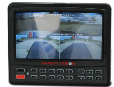
CP4 Touch-Screen Monitor