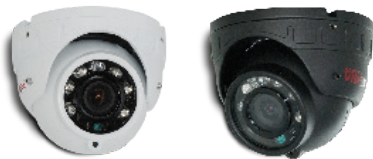
41 AHD Cameras